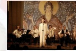
Belo Platno Ensemble – White Linen Ensemble