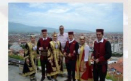
KUD Kopaonik Leposavic