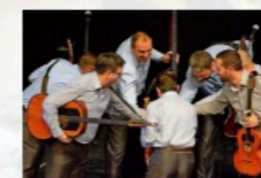
Zorule Tambouritza Orchestra