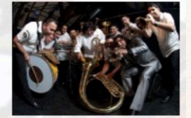
Boban and Marko Marković Brass Band