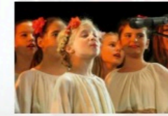
"Prelo" Singing Group Belgrade Serbia