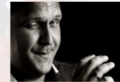
Dejan Petrovic Big Band