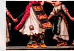
"Kolo" Professional National Folk Dance Ensemble